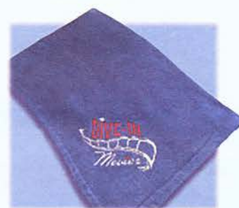
D1 DIVE-IN BLANKET $23.00