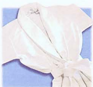
A DELUXE BATHROBE $49.00