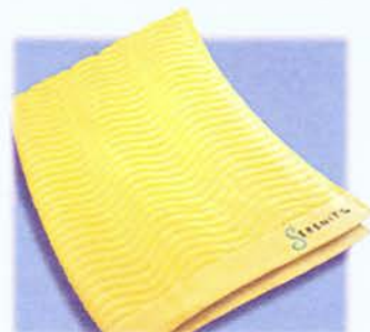
B1 SERENITY BEACH TOWEL $22.00