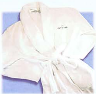
D CLOUD 9 SPA ROBE $59.00