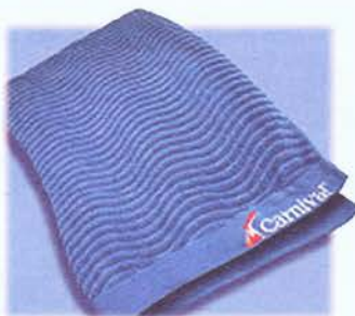
B BEACH TOWEL $22.00